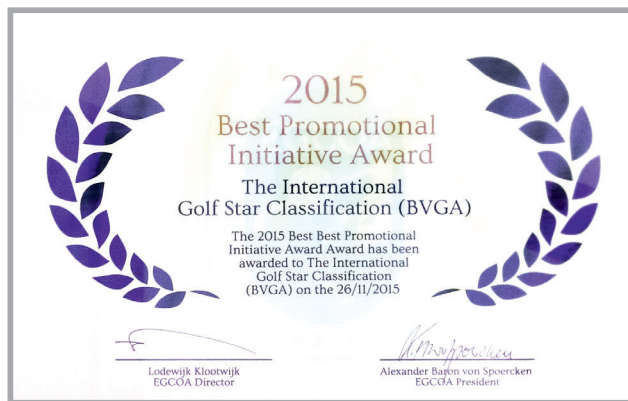
Best Promotional Initiative Award